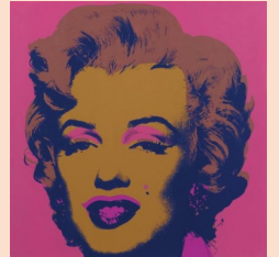
Andy Warhol: Marilyn Monroe

In Year 3 , printmakers use simple processes to make more complex designs, making a printing block and a two-colour print. They produce a monoprint—only one final image is made, making the technique closer to drawing or painting than other print processes.