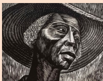
Elizabeth Catlett: (left) My right is a future of equality with other Americans, (right) Sharecropper